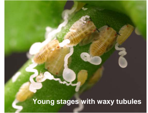
Young stages with waxy tubules