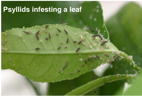
Psyllids infesting a leaf