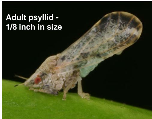
Adult psyllid - 1/8 inch in size