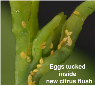
Eggs tucked inside new citrus flush