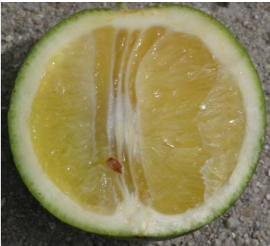
Lopsided bitter, hard fruit with small dark aborted seeds