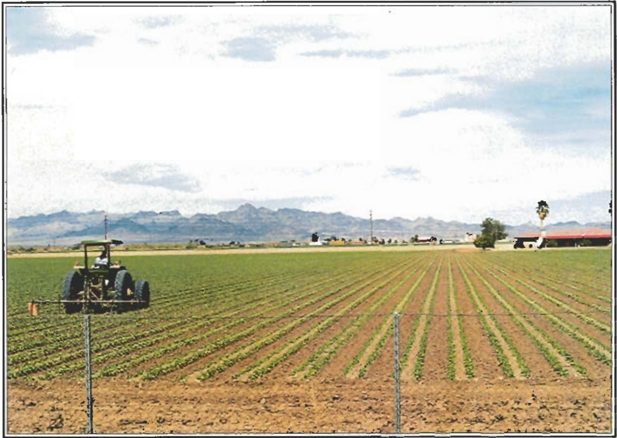
Blythe area head lettuce field